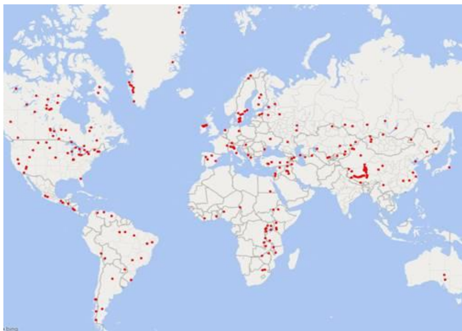
Location of the 250 lakes included in the CRDP V1.0